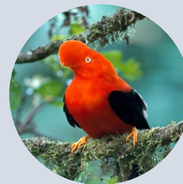
Andean Cock-of-the-Rock Rupicola peruviana