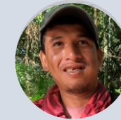
Chama Boat Driver