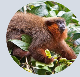
Madidi Titi Callicebus aureipalatii