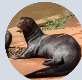
Giant Otter Pteronura brasiliensis