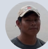
Denir Boat Driver