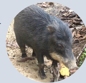
White-Lipped Peccary Tayassu pecari albirostris